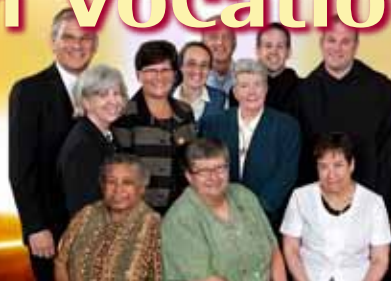
NRVC BOARD MEMBERS

NRVC National Religious Vocation Conference