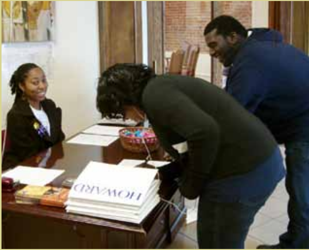
SIGN ME UP —Students with the Howard University Newman Club Center in Washington, DC sign in for a vocation rally day held March 27 at the university. Several priests, sisters, and brothers gave presentations during the full-day event. The day ended with a Palm Sunday procession and liturgy. Approximately 30 students took part in the event.

status will be given at the business meeting of the NRVC Convocation in November.