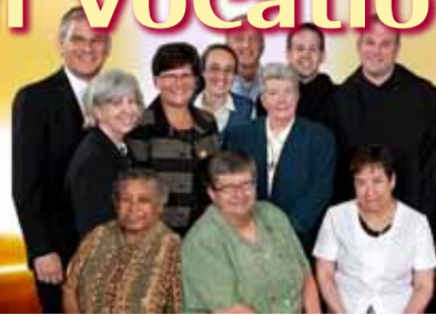
NRVC BOARD MEMBERS

NRVC National Religious Vocation Conference